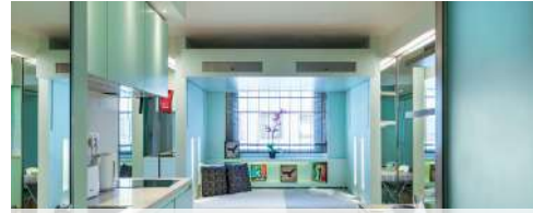
THE STAY CLUB CAMDEN

Studios are equipped with a double bed study space, kitchenette, bathroom and plenty of storage starting from £385 per week.