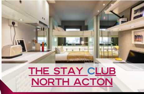
THE STAY CLUB NORTH ACTON

*PARTNERSHIP OFFER: 5% discount for the whole stay booking fee. Make sure you mention you are joining OMNES in London.