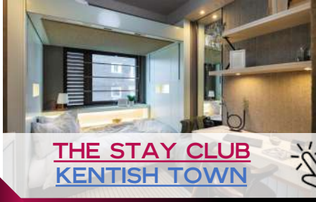
THE STAY CLUB KENTISH TOWN

Studios are equipped with a double bed study space, kitchenette, bathroom and plenty of storage starting at from £327 per week.