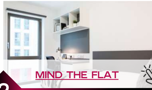
MIND THE FLAT

Offers flat share across the country. You can contact flatmate directly and ask questions before signing the contract. You can post your own room, when you wish to leave.